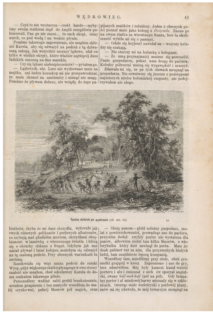
Figure 2. Wędrowiec , 1877, vol. 1, no. 1, p. 41.