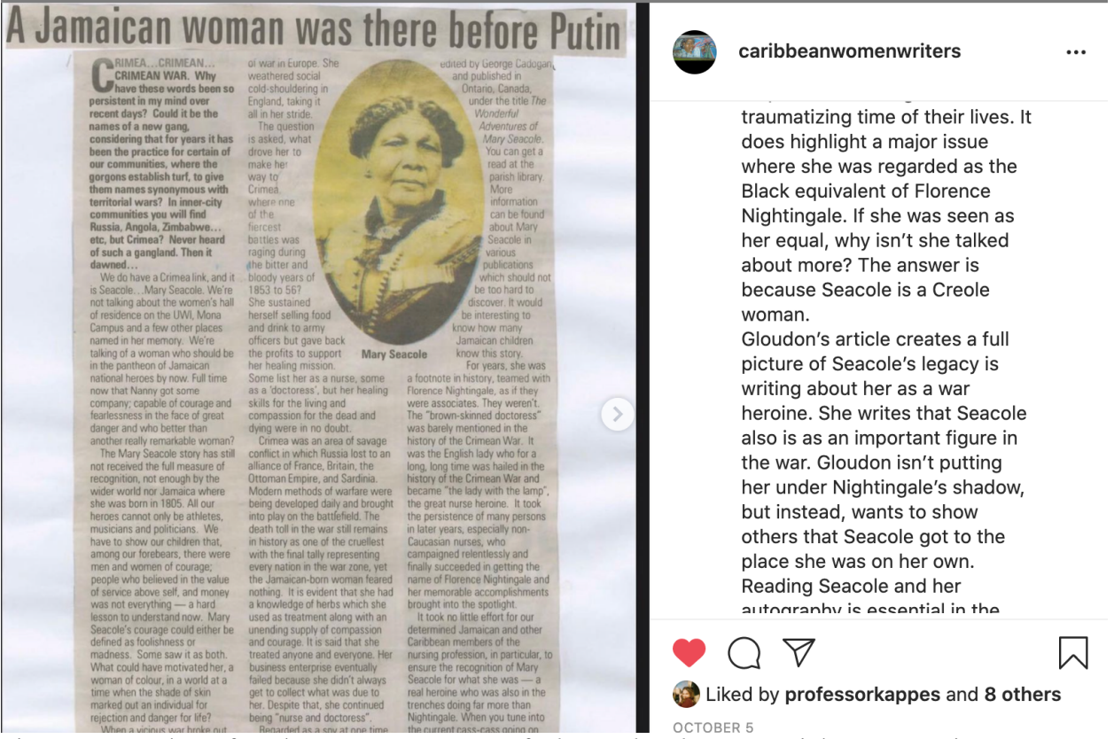
Fig. 2. Screenshot of student Instagram post of The Daily Observer article, "A Jamaican woman was there before Putin."

"Thank you so much for sharing and raising awareness <3." Instagram enabled student writing to extend beyond the confines of the classroom. Students were able to see the tangible and real connections that were possible through this form of advocacy writing, creating and entering into a network of digital knowledge production.