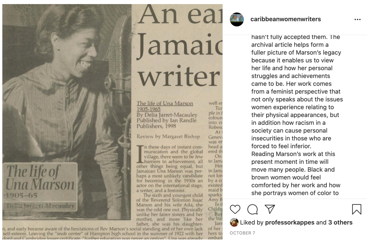
Fig. 3. Screenshot of student Instagram post of article "An early Jamaican writer" and commentary.