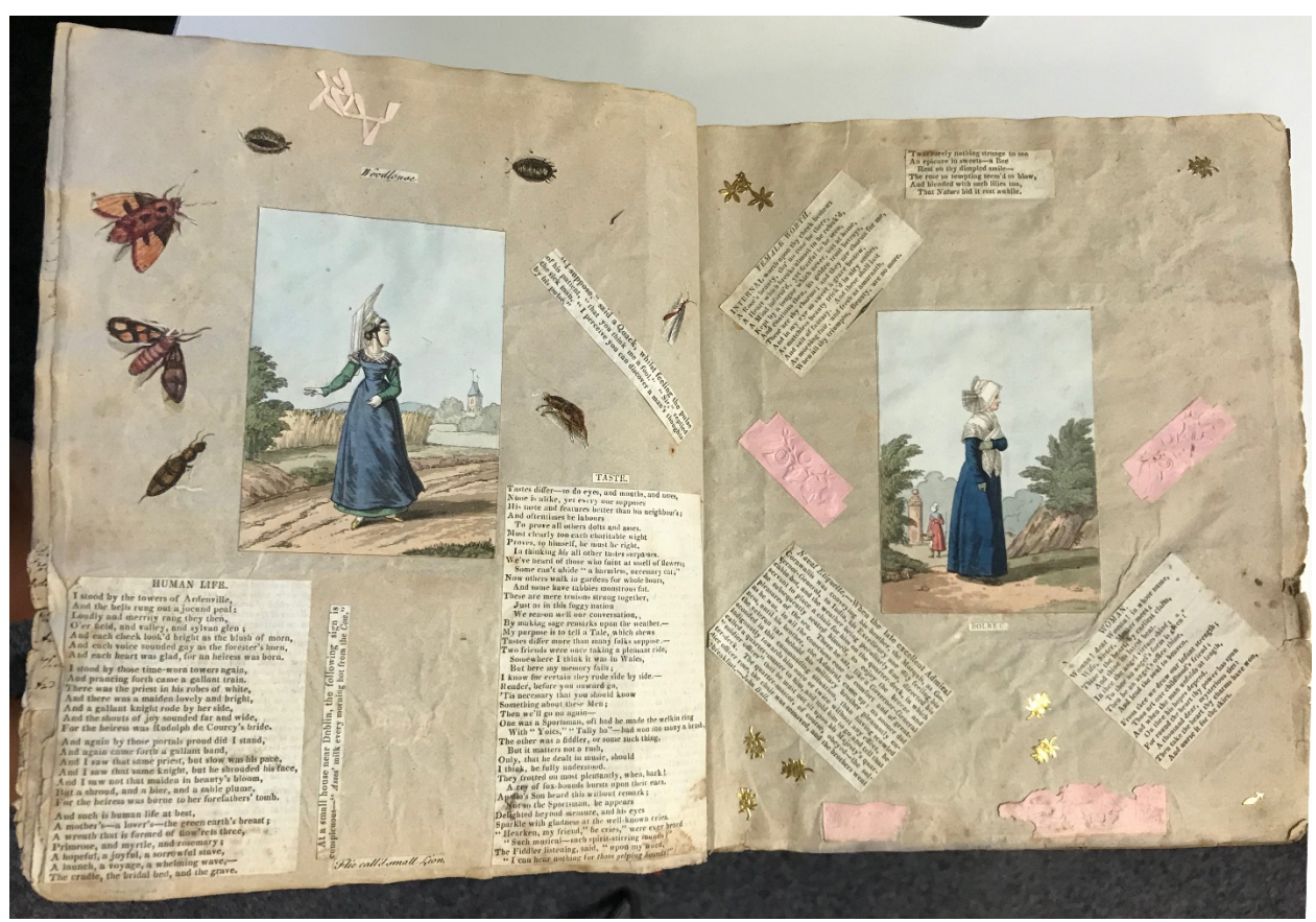
Figure 4. Two-page spread from an anonymous scrapbook, 1820–30, #174, Harry Page Collection, Special Collections, Manchester Metropolitan University.

This passage was originally published in Barnard Trollope's poetry collection Leisure Moments (1826). The passage compares female beauty to a flower, which is an irresistible, "natural" attraction. The scrapbook extends the metaphor by placing cutouts of insects on the opposing page, as if they are attracted to the superficial feminine beauty depicted in the plates. Another verse cutting, "Human Life," tells the sad story of an heiress "lovely and bright" who is born, marries, and dies, serving as a reminder of the ephemerality of both beauty and life. The lily blooms but ultimately fades and expires.