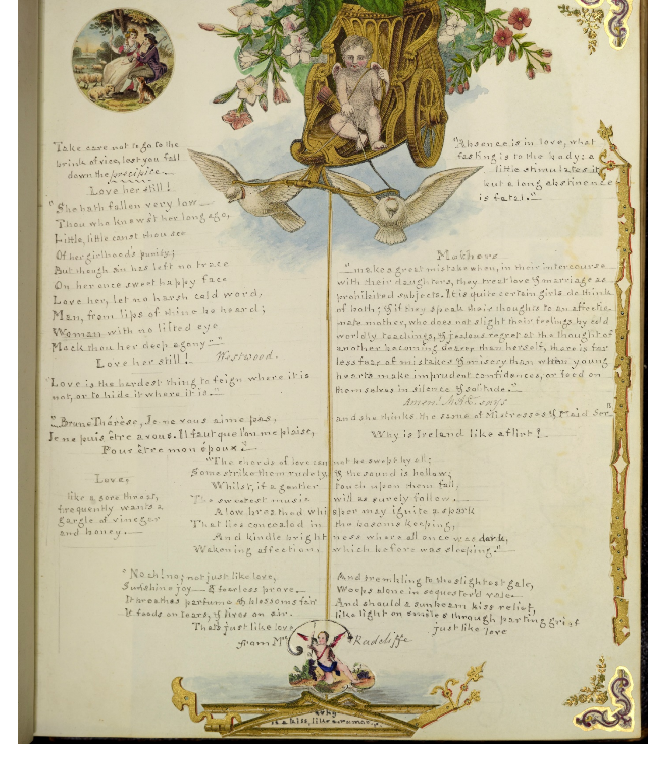
Figure 6. Page from the scrapbook of M. A. C., 1850, #144, p. 26, Harry Page Collection, Special Collections, Manchester Metropolitan University.