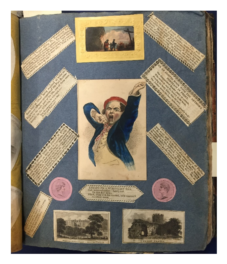
Figure 2. Page from an anonymous scrapbook, ca. 1834, #160, Harry Page Collection, Special Collections, Manchester Metropolitan University.

<10>Of particular interest are the borders around the snippets on this page—all of which were cut and pasted from another source. This sort of embellishment is designed to obscure the cut edges of the newspaper fragments, making them seem more pictorial. We can perhaps approach them as Elaine Freedgood interprets decorative fringe in Victorian interior decoration: as a kind of "kitsch" or excessive decoration which obscures and blurs the edges of things, "construct[ing] limits as variable, permeable, and attenuated structures" (257).(4) If the edges of newspaper scraps define them as paper ephemera, the addition of a decorative border is simultaneously an attempt to obscure the original publication context, to make the print object newly interesting, and to suggest the fungibility of borders imposed by print culture, which can be altered and repurposed for other kinds of artistic and domestic purposes.