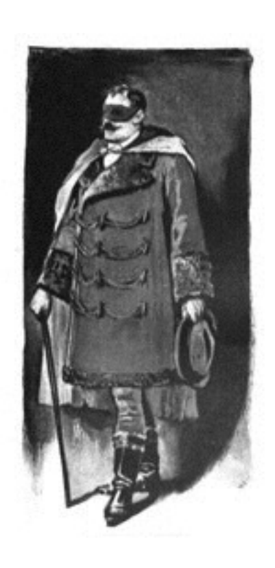
Figure. 1. The King of Bohemia, pen, ink, and wash from Arthur Conan Doyle, The Original Illustrated Sherlock Holmes (Secaucus, NJ: Castle Books, 1979; 14).(^)