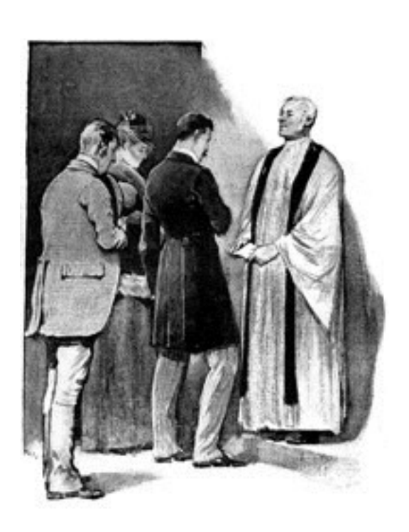
Figure. 3. Irene Adler's Wedding, pen, ink, and wash from Arthur Conan Doyle, The Original Illustrated Sherlock Holmes (Secaucus, NJ: Castle Books, 1979; 19).(^)