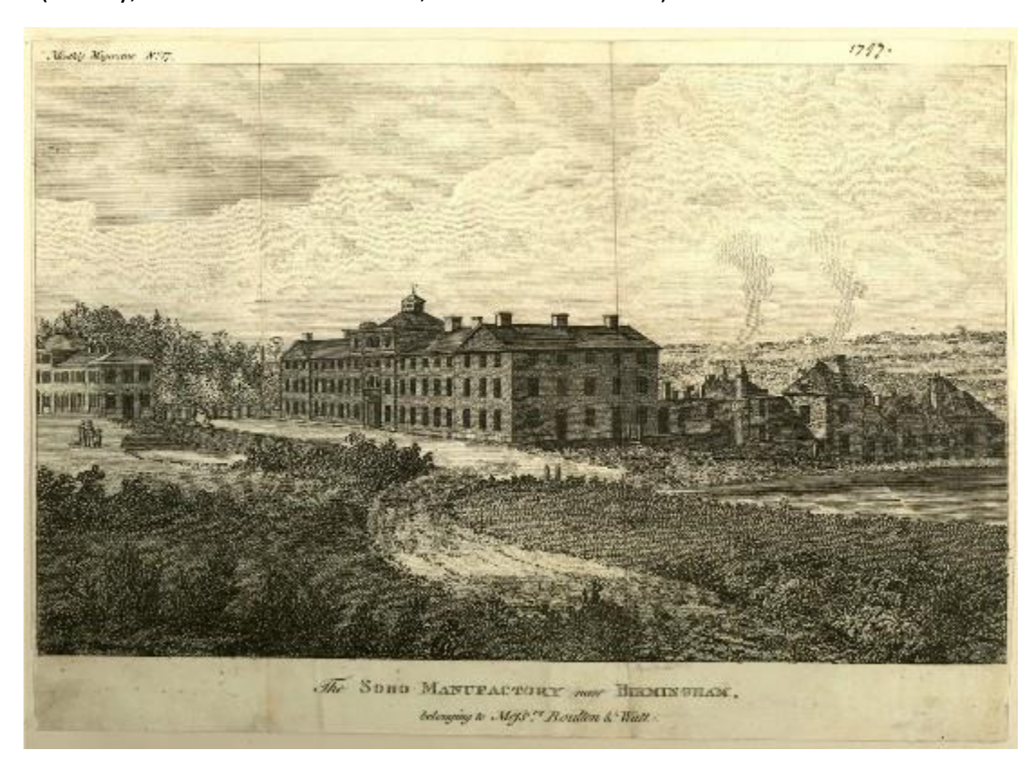
Figure 2: 'The Soho Manufactory near Birmingham Belonging to Messers Boulton & Watt'. 1797. By permission of Birmingham Museums Trust.( \underline{3} )

hands of men" in iron and steel forging before the introduction of machinery had "occasioned Sheffield to abound in cripples and in weak deformed people." He did acknowledge, though, that the nature of metal production gave "to the manufacturers, as well as the town itself, a very dark complexion" (Housman 3-4). This was arguably reflected in scenes of manufacturing in Sheffield and the surrounding area, in which industrial landscapes featured small dark figures in the foreground. Sheffield was perceived as a dark grimy city with dark grimy men, whose bodies nevertheless remained intact. Yet in such surviving visual depictions of industry of this area, depictions of the labouring body tend to be small details in scenes which focus on workplaces or landscapes. Depictions of workers in sketches in both small workshops and large manufactories were often dwarfed by a natural environment which served as a foil to industrial labour (Harvey, "Craftsmen in Common," Ravenhill-Johnson).