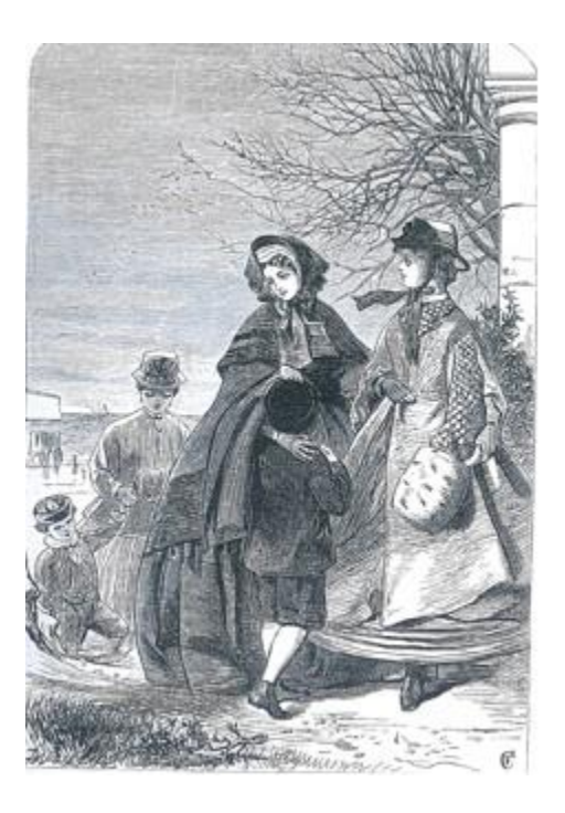
Figure 1. "Lady Temple gazing round on the scenes of her youth" (Jan. 1864)

comic situations created in novels earlier in the century by Mrs. Fanny Trollope, and therefore needed images that elicited sympathy or captured a key event without the use of exaggeration or caricatures.