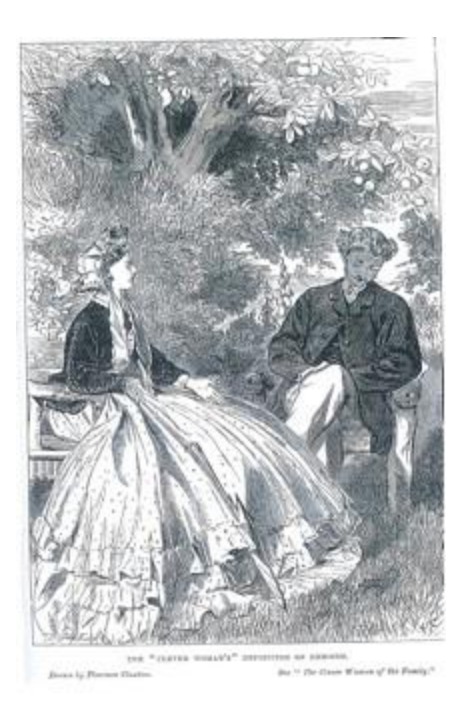
Figure 5. The "Clever Woman's" Definition of Heroism (April 1864)