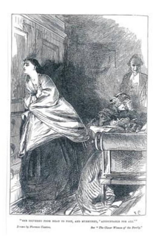
Figure 10. "She shivered from head to foot, and murmured 'Accountable for all'" (Oct. 1864)