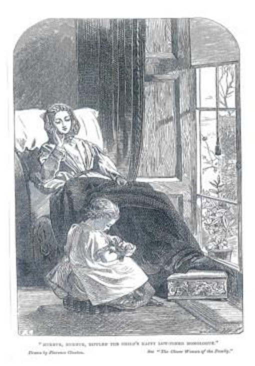
Figure 2. "Murmur, murmur, rippled the child's happy low-toned monologue" (Feb. 1864)

<16> Unlike the common practice in books with illustrations, no indication is given here or in any of the pictures to what incident or quotation each drawing is referring – to page 14 of the magazine for the opening picture in the January issue and page 183 in February. This latter was a long way from the actual illustration as the chapters from Clever Woman wereassigned to the last pages that month. On some occasions, as in the issues for March, April, May, and June, the picture happens to be placed alongside the relevant page, but often the reader is left to search for the words or event to which a picture is providing an image. In July, readers must have been mystified by the illustration placed opposite page 26 and the start of Chapter 9 – "Oh, Colonel Keith," said Lady Temple. "What shall I do?" – (Figure 3), as this scene does not occur anywhere in that month's extracts. Only when they acquired their next month's magazine in August, would they discover the episode in Chapter 11 where Lady Temple utters this plea because she is dismayed at the proposal of marriage from Colonel's Keith's elderly brother, Lord Keith (a character who had not yet featured in the previous chapters). This inaccuracy over the placing of the illustrations is confirmation for Simon Cooke's comments about John Hogg's failure to ensure that there was strong management of all aspects of his periodical (" CFM " Victorian Web ).